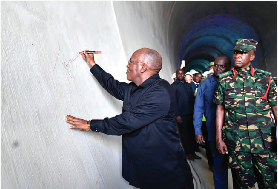
ABOVE: Fifth Phase President of the United Republic of Tanzania H.E Dr. John Pombe Magufuli, signing the wall of the Standard Gauge Railway (SGR) tunnel in Kilosa, Morogoro.